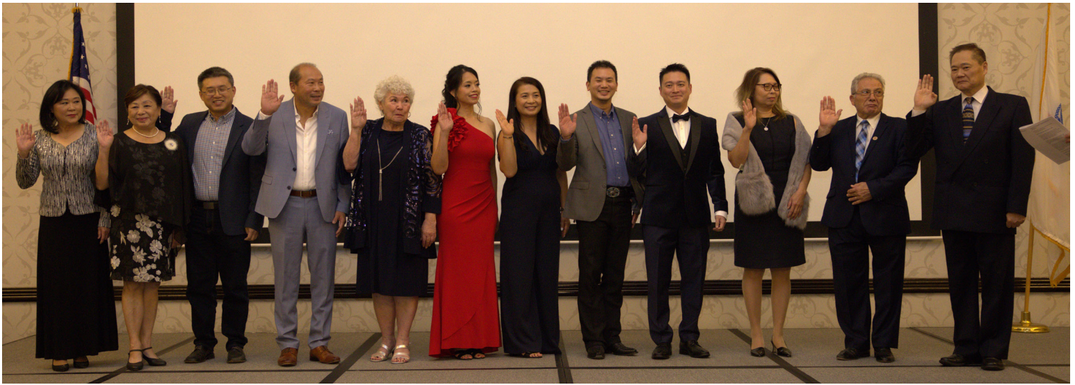
Installation of the Board of Directors